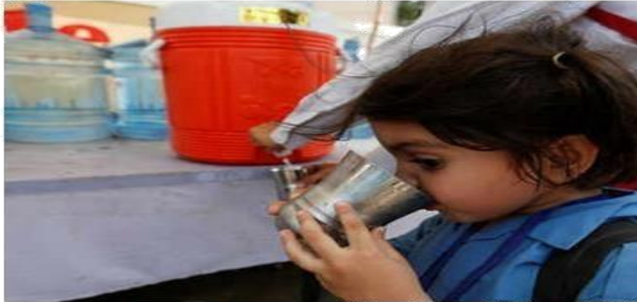
Representative image

NEW YORK: Maybe it was because when the waiter asked, “Still or sparkling?” you chose sparkling. It could have also been that you were ravenous and ate a little too much. Or, possibly, it was your ex, who happened to be dining at the same restaurant and stood a little too long over your table making awkward small talk. All of these things, hic, might cause spasms, hic, in your diaphragm,