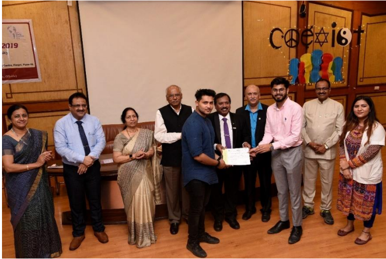
1 st Prize in Short Film Making- Team MBBS

The prize winning short films prepared by students of different sister colleges, were played which conveyed a beautiful message that there is no disparity when healthcare is provided to patients of different cultures.