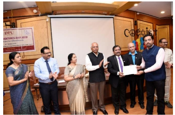
1 st Prize in Scientific Poster Presentation.