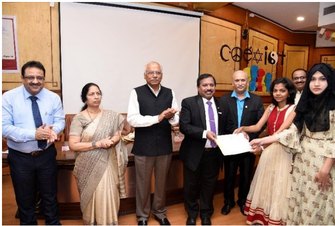
1 st Prize in Artistic Poster

theme “ Respect for Cultural Diversity ”). The winners were felicitated during the main event. All students received the participation certificates.