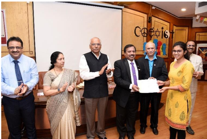
1 st Prize in Photography