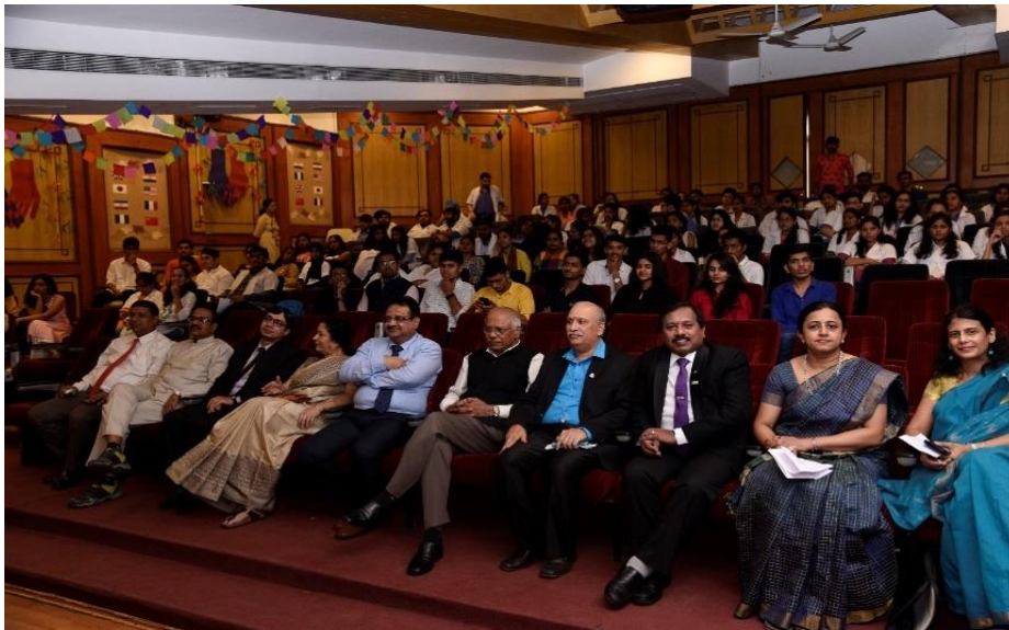
Guest speaker and Representative of UNESCO chair in Bioethics

1 st prize winning team of MBBS UG, tried to depict the influence of various cultures in our life and the journey of a student who left his own place to study in a far different area, how the life gets change and we learn that it's all in respecting each other's culture to live happily and being blessed for the diversity.