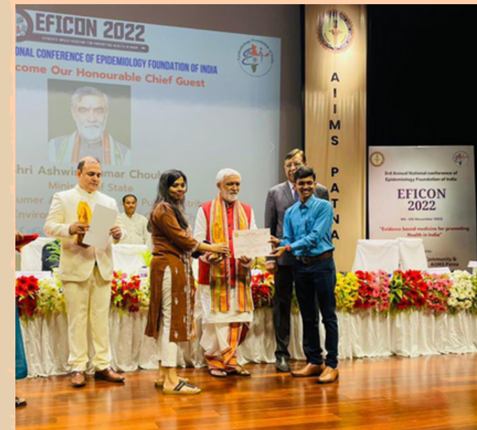
2nd Place in EFICON Mindbenders Quiz