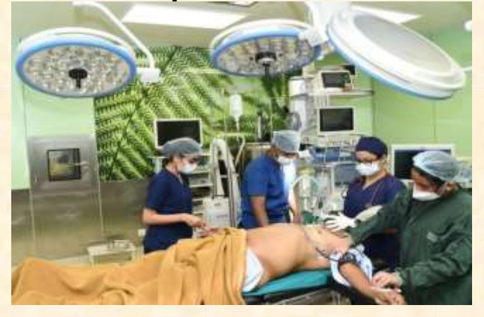
Organ transplant Total no- 311