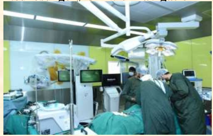
Times of India Health Icons awards 2022 Best multi- Organ transplant department and Robotic surgery Department in Dr D.Y. Patil Medical College, Hospital & Research Center, Pimpri, Pune