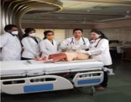
Interdepartmental workshop and programme's