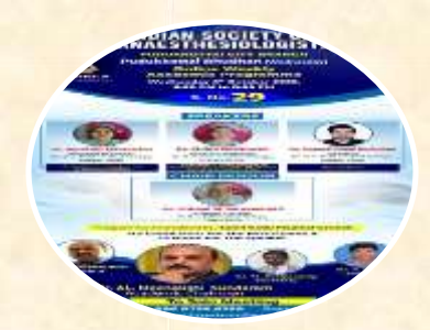
ISA webinar, Pudukkottai Oct- 2022