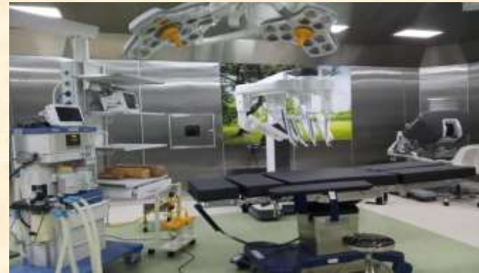
Neurosurgery OT with navigation

Robotics OT With DA- VINCI 4th Generation System