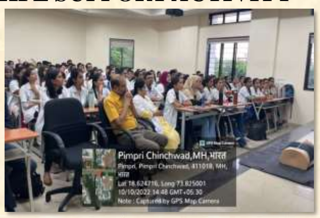
Dr. D.Y. Patil College of Physiotherapy (October 2022)