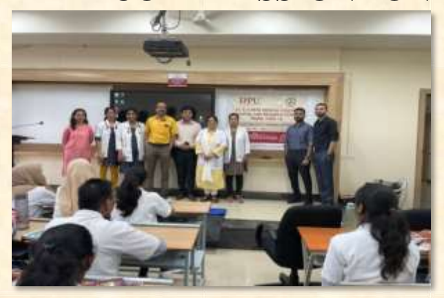
Dr. D. Y. Patil College of Homeopathy (October 2022)