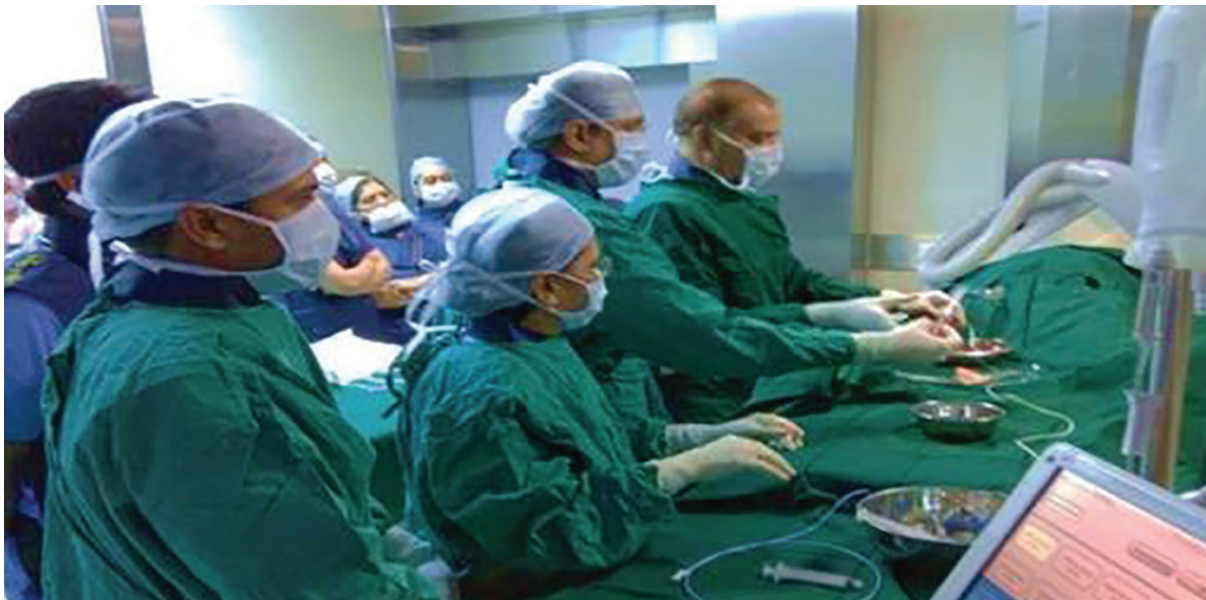
2 WELL EQUIPPED CATHLABS