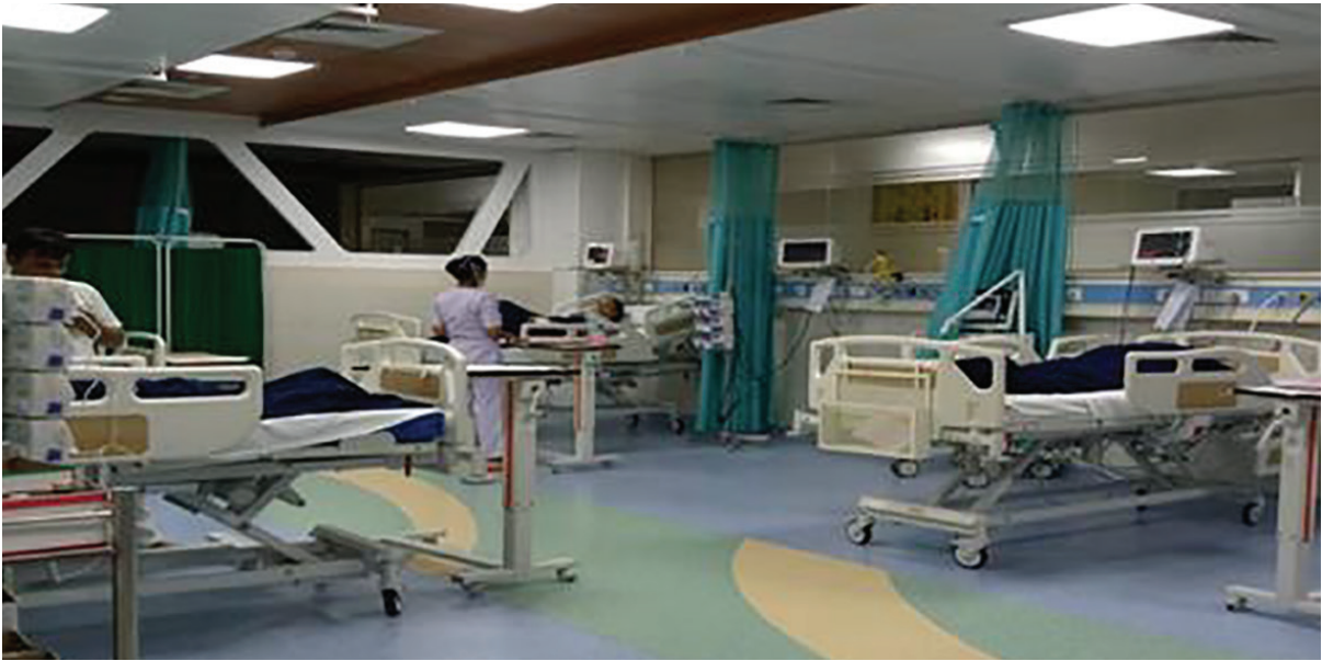
CARDIAC RECOVERY ROOM