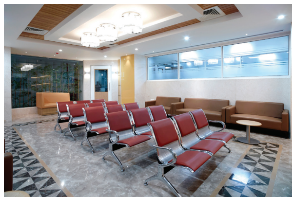
OUT PATIENT DEPARTMENT