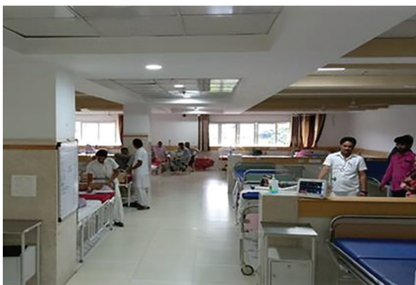
IN PATIENT DEPARTMENT