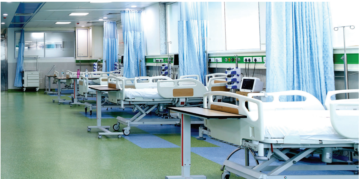
INTENSIVE CARE UNIT