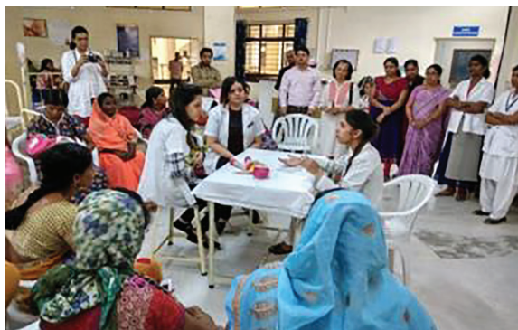
Breast feeding week celebration