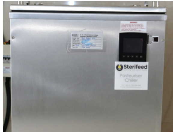
Pasteurizer & R. O. Machine