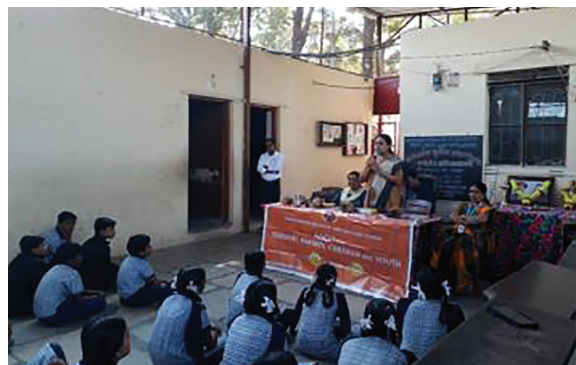
Adolescent awareness program