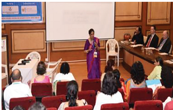
International conference on adolescent health