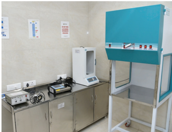
Laminar Air Flow Cap Celler, Miris, Milk Analyzer