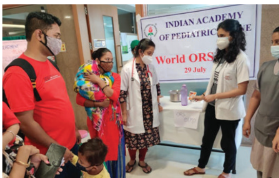
ORS day celebration