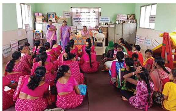
ANGANWADI WORKERS TRAINING PROGRAMME