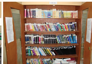
Well Stocked Department Library