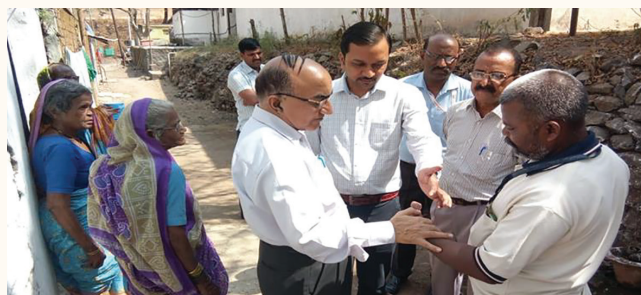
Social Outreach Programmes