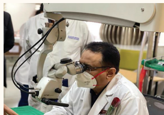
Microsurgery Skill Lab Training