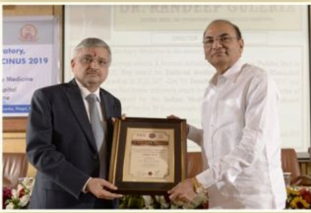
First Dr. P D Patil Oration Award ACINUS 2019