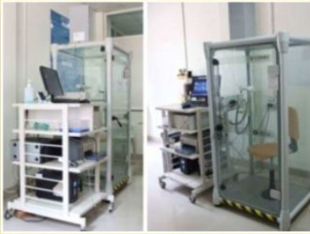
Pulmonary Function Test