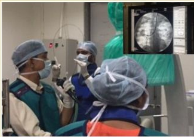
Fluoroscopy Guided Bronchoscopy