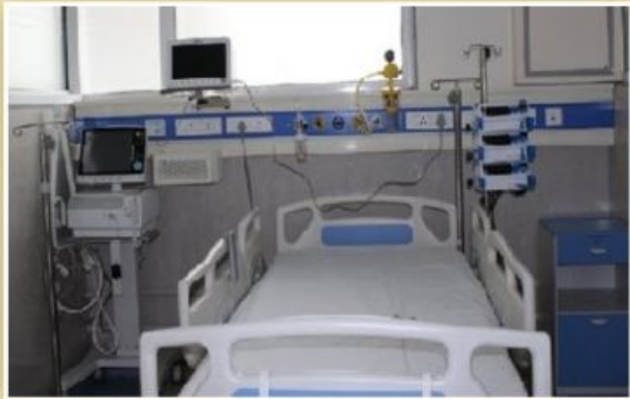
RICU with negative pressure control, HPA filtration and UV Radiation (Complete infection control)