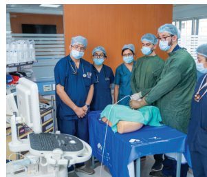
USG Guided Central Vein Catheter Insertion