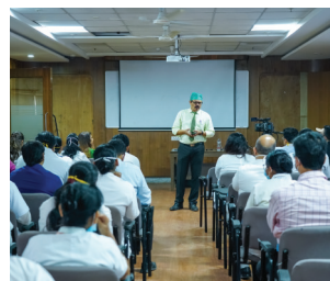
Train the Trainer 2022