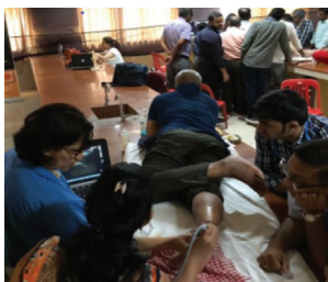
MSK USG Workshop 2018