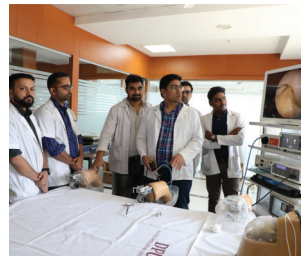
Knee Arthroscopy Training