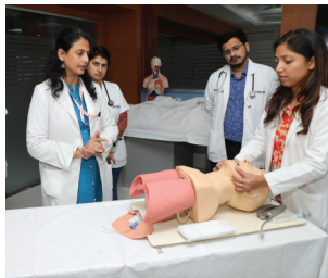
Basic Air Way Management Training