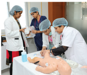
Pediatric Intraosseous Cannula Training