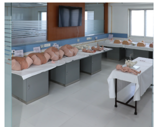
Separate Section for UG, PG and Super Speciality Training