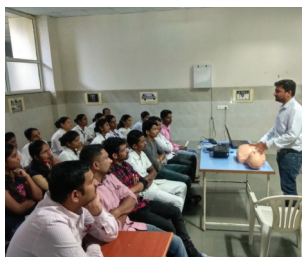
BLS Training 2017