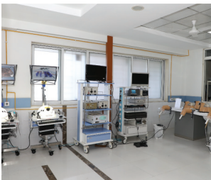
Laparoscopy, Endoscopy & Arthroscopy Section