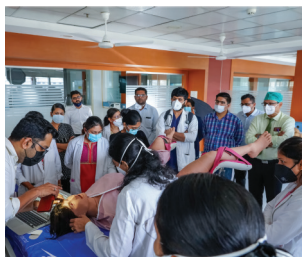
Obstetrics Training Module On LUCINA