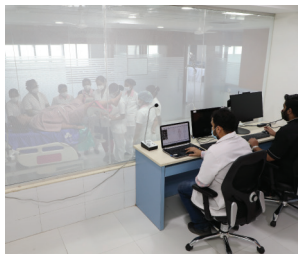
Recording & Audiovisual Facility