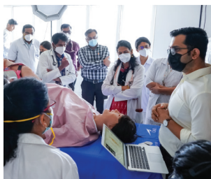
High Fidelity Simulation Training