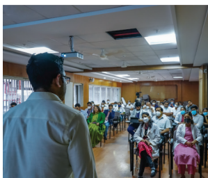
Mayo Clinic Certified Trainer