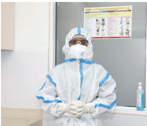
Covid Skills Training Section