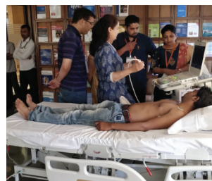
FATE USG Training 2019