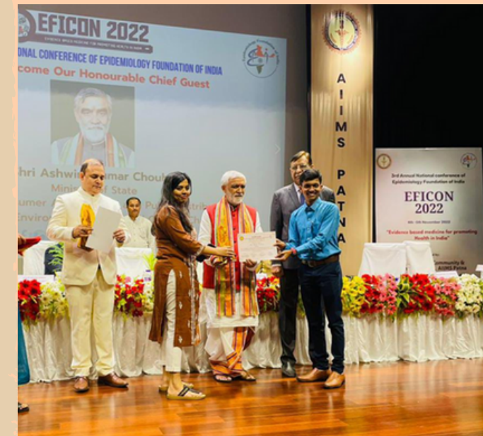
2nd Place in EFICON Mindbenders Quiz