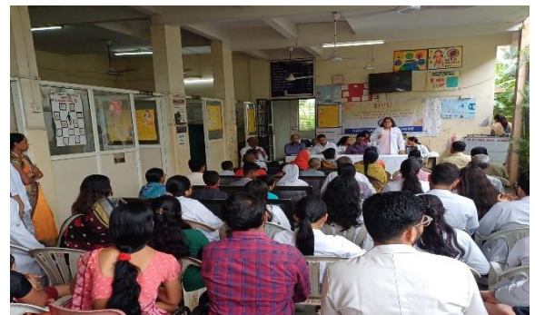
Latitude: 18.6759° Longitude: 73.9052°