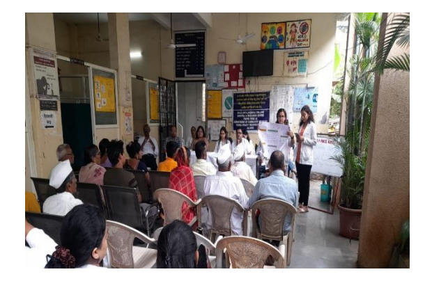
Latitude 18.6759° Longitude: 73.9053°