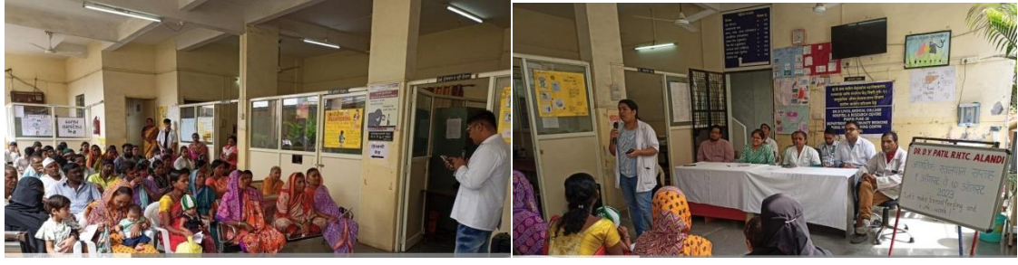
Latitude-18.6352° N Longitde-73.9083° E