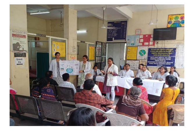
Latitude: 18.6769<sup>o</sup> Longitude: 73.7095<sup>o</sup>

Total Number of beneficiaries -89 males and 34 females