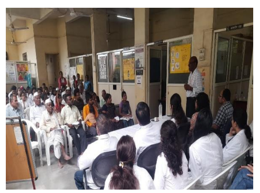
Latitude 18.6758° Longitude: 73.9053°

Beneficiaries-86 (46 males and 40 females)