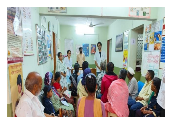
Latitude: 18.6342° Longitude: 73.8105°