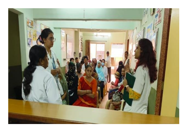
Latitude: 18.6342° Longitude: 73.8105°