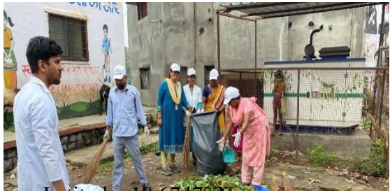
Latitude- 18.6747° N Longitude- 73.8982° E