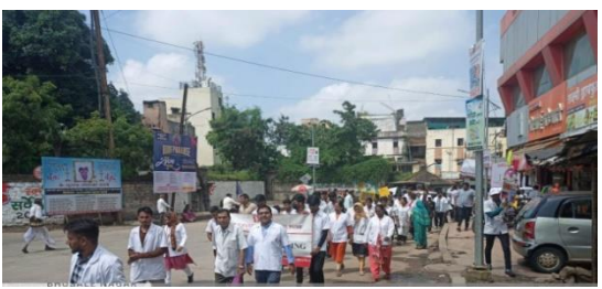
Latitude- 18.6781° N Longitude-73.8990° E