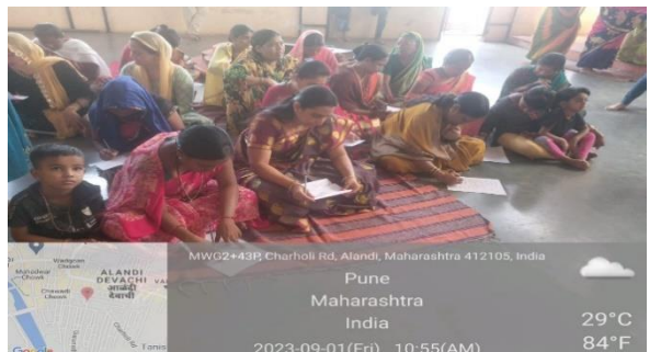
Latitude-18.6352° N Longitde-73.9083° E

The event was successfully conducted and well received by the crowd. No. of beneficiaries: 70