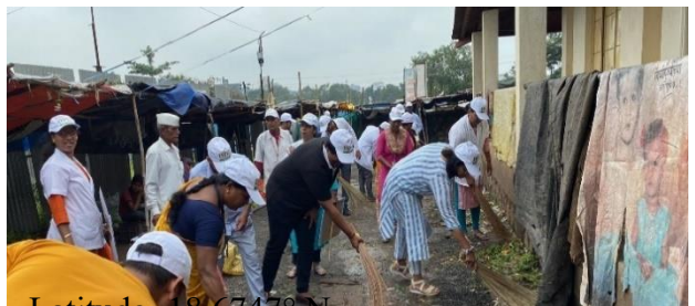
Longitude- 73.8982° E

A National Abhiyan on Swachata Hi Seva Hai was conducted on 1 Oct 2023 at 10 am to 12 am at Bhaji Mandi Alandi. The participation of various stakeholders, including medical officers, interns, staff, civilians, and school students involved in this event to show their collective efforts towards cleanliness. Cleaned up a significant area around 5000 square feet in the Bhaji Market, followed by a rally from Bhaji Mandi to RHTC Centre to create awareness of hygiene and sanitation by utilizing visual aids like play cards and slogans. The event was successful. Tea & snacks were provided at the end. No. of beneficiaries: more than 100