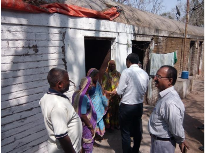
Surgical Rehabilitation procedures were offered To the patients At Our Hospital Free Of Cost.