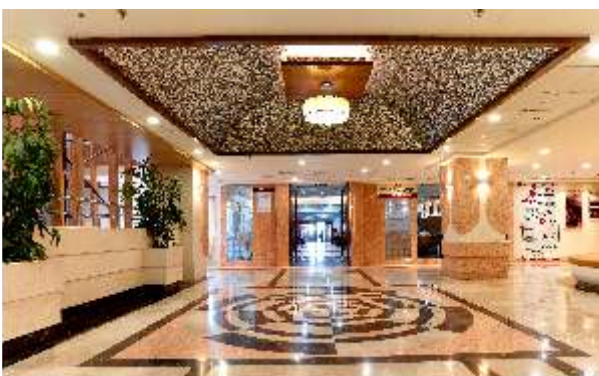
Learning Resource Centre or Central Library