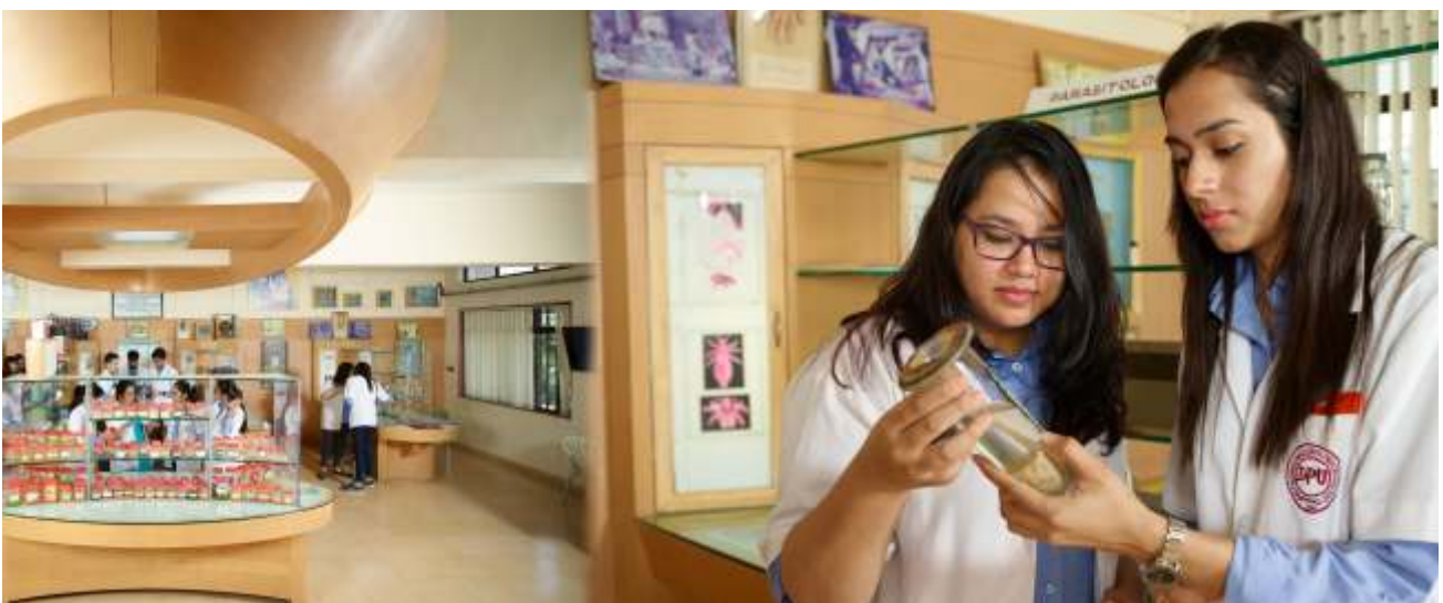
Community Medicine Museum