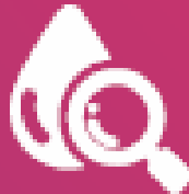
MILK TEST REPORT