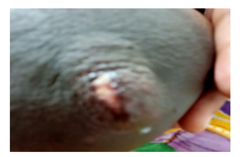
Support to problems of nipple e.g. crack nipple