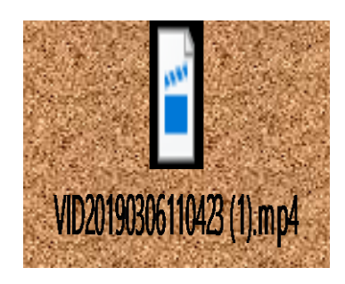
Video of Breastfeeding on Flat nipples