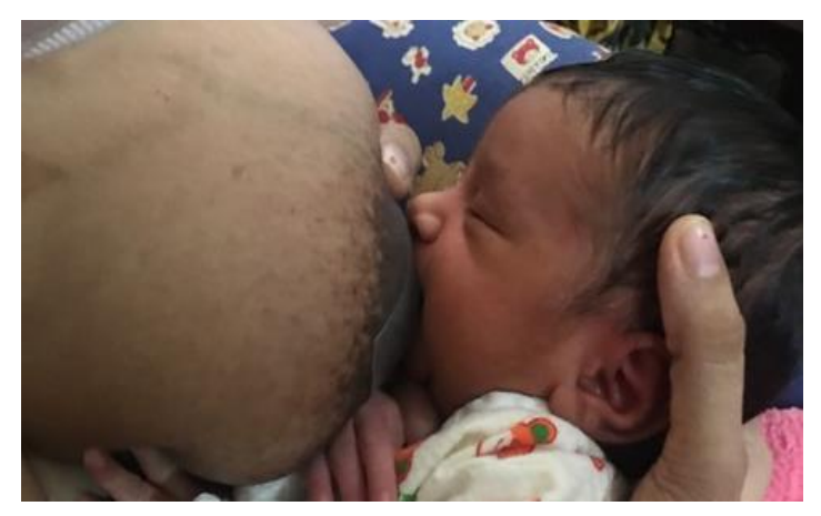
Baby Latch With Nipple Shield