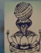
Shikshan Prasarak Mandali